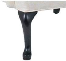
Queen Anne Leg